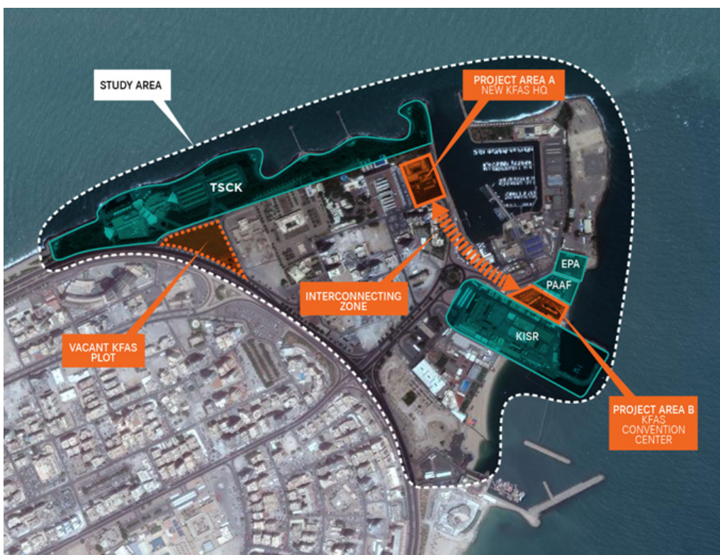
Figure 2: The competition area and important buildings