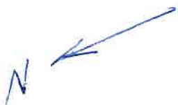
illustration number one