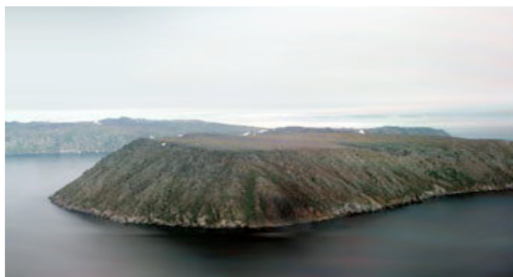
Figure 2. Two diomedede islands( American one in the front and Russian one in the back)

The purpose of the competition is to provide comprehensive material which can serve as a basis for the drafting of further actual plan and for decision-making rather than to produce complete or final plans. On the basis of the result of the competition the jury and the Organizing Committee could give a recommendation of further measures. The FPU may commission further planning from the winners of the competition.